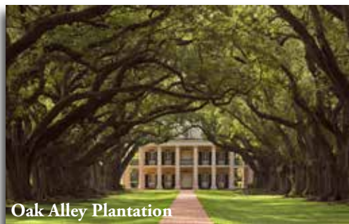
Oak Alley Plantation